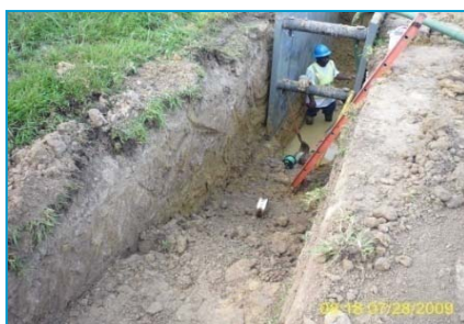
Trench boxes are used for pipeline installation.

The project consists of approximately 1,760 ft of 8-inch, 10-inch, and 12-inch gravity and approximately 2,520 ft of 36-inch and 60-inch gravity upstream of PS 59. This project also includes approximately 1,410 ft of 24-inch and 30-inch force main to extend the PS 60 force main.