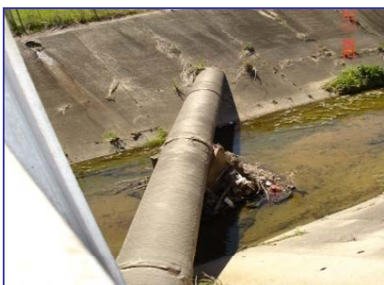
Over 3,000 linear feet of gravity and force main will be upgraded .